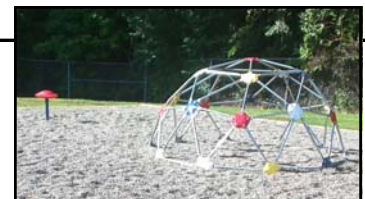
Clement Park located in Northside

New playground equipment is being installed in various Town Parks. Most recently, Clement Park and Catallo Park had two new pieces added. The Town Board has allocated funds in the 2017 budget so that additional parks will see equipment upgrades during the spring of 2017.